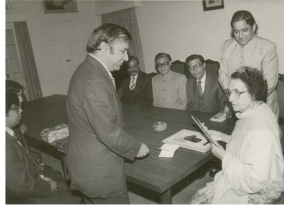
Indira Gandhi then PM of India, releasing a comic book on communal harmony "Raman , United We Stand "