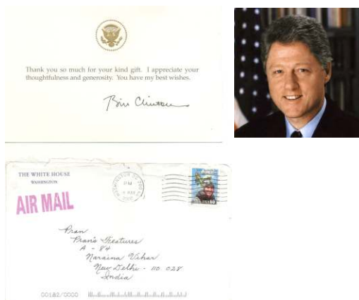
A letter of appreciation from Bill Clinton