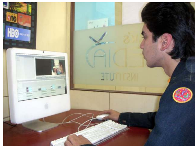
Editing Table - FCP

The Pran's Media Institute's Digital Editing Workshop are intensive courses designed to familiarize students with all the skills necessary to work with Final Cut Pro.