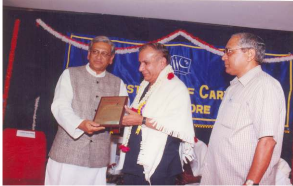
'Lifetime Achievement Award' 2001, presented by Chief Minister, SM Krishna on behalf of Indian Institute of Cartoonists.